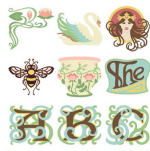
Art Nouveau Cartridge