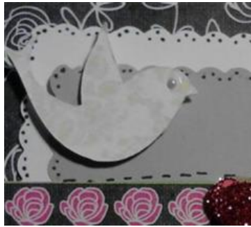
Two doves with heart