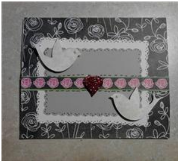
This card is a tri-fold