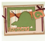
'6 Today' Card