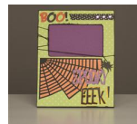
BOO! Halloween Frame