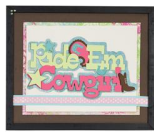
Ride 'Em Cowgirl Frame