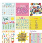
Cricut® Designer's Calendar Cartridge