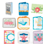
Cricut® Projects Cartridge, Creative Cards