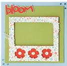
Flower Frame Layout