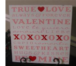
Word Collage Boards