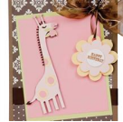
Happy Birthday Card - Giraffe