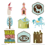
Cricut® Winter Woodland Cartridge