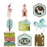
Cricut® Winter Woodland Cartridge