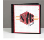
NYC 2009 Mini Album