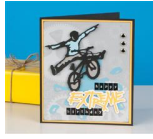
Extreme Birthday Card