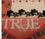
You are my True Love