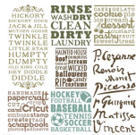
Word Collage Cartridge