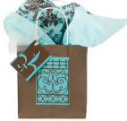
Gate Gift Bag