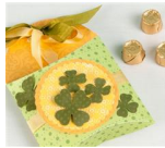
St. Patrick's Day Treats