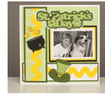
St. Patrick's Day Layout