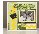
St. Patrick's Day Layout