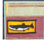
Father's Day Card