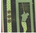
Masculine Birthday Card