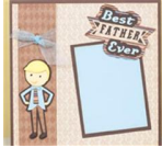
Best Father Ever layout