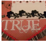
You are my True Love