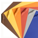
Cricut® 12" x 12" Cardstock, Southwest