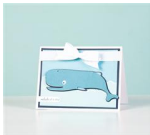
Whale of a Day Card