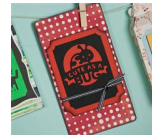
Cute As A Bug Card