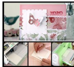
Butterfly Kisses Card