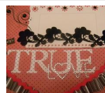
You are my True Love