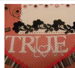
You are my True Love