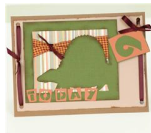
"6 Today" Card