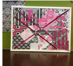
Easy DIY Bulletin Board.