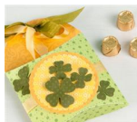
St. Patrick's Day Treats