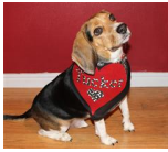
Valentine Doggie Bandana