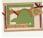
"6 Today" Card