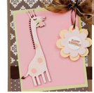
Happy Birthday Card - Giraffe