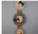
Boo Rosette Wall hanging