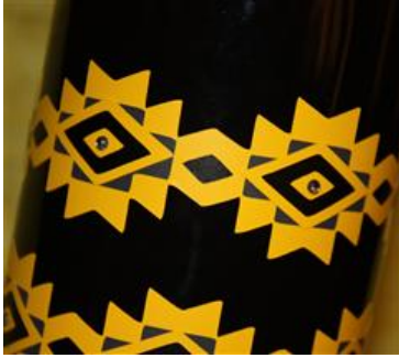
Upclose of Vinyl and Jewels