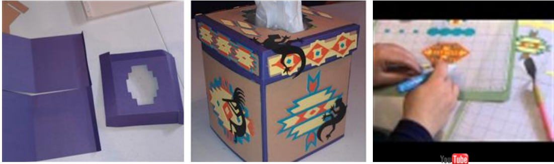
Part 1 video, SW designs

Download the cutfile for CCR and cut out pieces. When I cut out the Southwest pieces I used 3 mats and left all pieces on the mat until I put them all together, it is easier this way to know what goes where. I also made a video showing me putting them together.