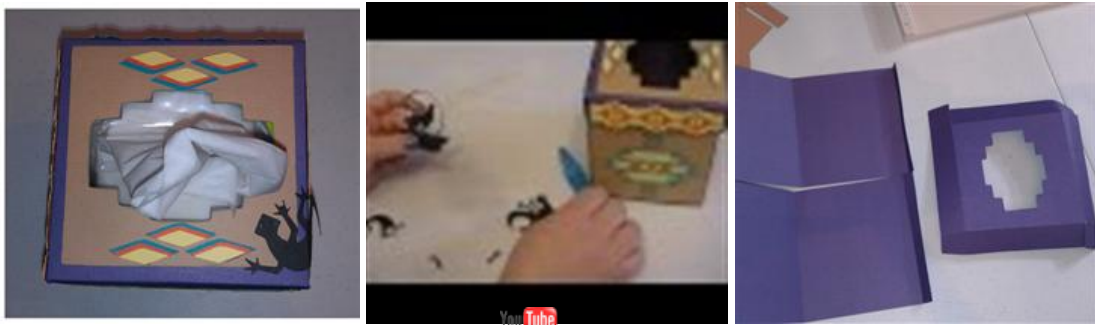
Part2 video, the Box

For the base of the box you will need to score the two pieces at 1/2" and 5" and fold and then for the lid, score at 1" on every side. Cut 1" up on the score line on the right til you touch the other score line, turn and do to every side. Ad adhesive to the right of the cut on the whole square. Then fold under the piece to the left and adhere together. This part 2 video will show everything.