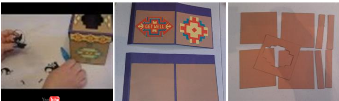
Part2 video, the Box

Here are the layer pieces and how they should be applied to the box, the narrow pieces are for the sides of the lid. I did ink the edges of these. Apply the Southwest designs to the box before you put the box together. After you have all the designs on put adhesive on the 1/2" tab and put box together, by putting the tab under the next base piece and then adhering the other tab to the other end. Again you may want to watch the video.