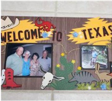
Welcome to Texas * a two-Page scrapbook layout

Assemble the project. Add your choice of embellishments. I pretty much put the "cowboy" cuts on Page 1 and the "critters" on page 2. The lizard crawled back onto page 1.