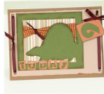
'6 Today' Card