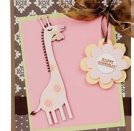
Happy Birthday Card - Giraffe