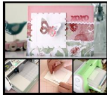
Butterfly Kisses Card