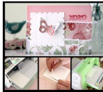
Butterfly Kisses Card