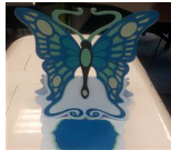
Butterfly Display card