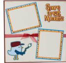
S'more Great Moments Layout