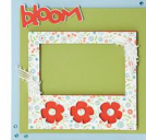
Flower Frame Layout