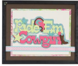
Ride 'Em Cowgirl Frame