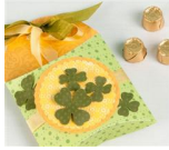
St. Patrick's Day Treats