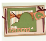
'6 Today' Card