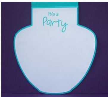
Inside of Invitation

Embossed sentiment of choice on solid piece and attach to inside of card. I used Pink By Design's Party Time stamp set and Recollections Glacier Embossing Powder.