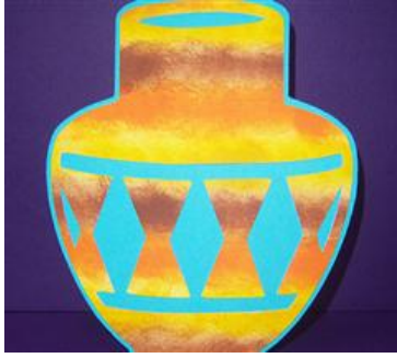
Southwest Party Invite

Score the back piece of the base of the card so it can open and close easily.