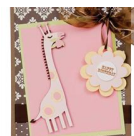
Happy Birthday Card - Giraffe