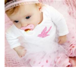
Bird Baby Sleeper