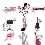
Quarter Note Cartridge