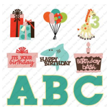
Birthday Bash Cartridge