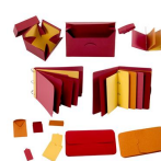
Mini Books Cartridge