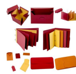
Mini Books Cartridge