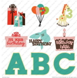
Birthday Bash Cartridge