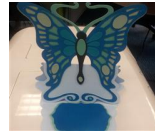
Butterfly Display card