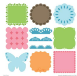
Elegant Edges Cartridge