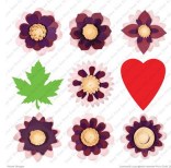
Flower Shoppe Cartridge