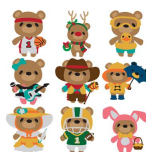
Teddy Bear Parade Cartridge