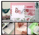
Butterfly Kisses Card