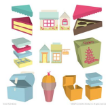
Sweet Tooth Boxes Cartridge