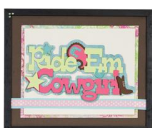
Ride 'Em Cowgirl Frame