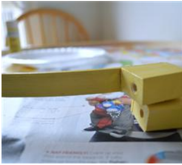
Paint just the outside hoop

I got a 23" quilters embroidery hoop and painted the outer ring yellow on the top of the hoop and the front. I didn't bother with the inside or back because they will be hidden once the fabric is in place.