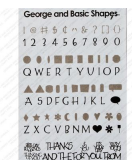
Cricut® George and Basic Shapes Cartridge