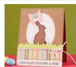
Chocolate Bunny Card