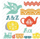
Folk Art Festival Cartridge