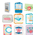
Creative Cards Cartridge