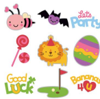
Create a Critter 2 Cartridge