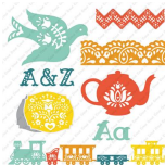
Folk Art Festival Cartridge