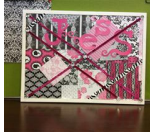
Easy DIY Bulletin Board.